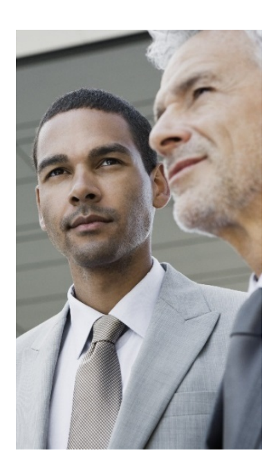
DELIVERING BREADTH AND DEPTH OF FUNCTIONALITY

JD Edwards EnterpriseOne solutions can help you integrate all aspects of your business—including customer relationship management, enterprise asset management, enterprise resource planning, supply chain management, and supplier relationship management. Oracle also provides the business intelligence and performance management tools that help you measure the value that JD Edwards EnterpriseOne solutions deliver.