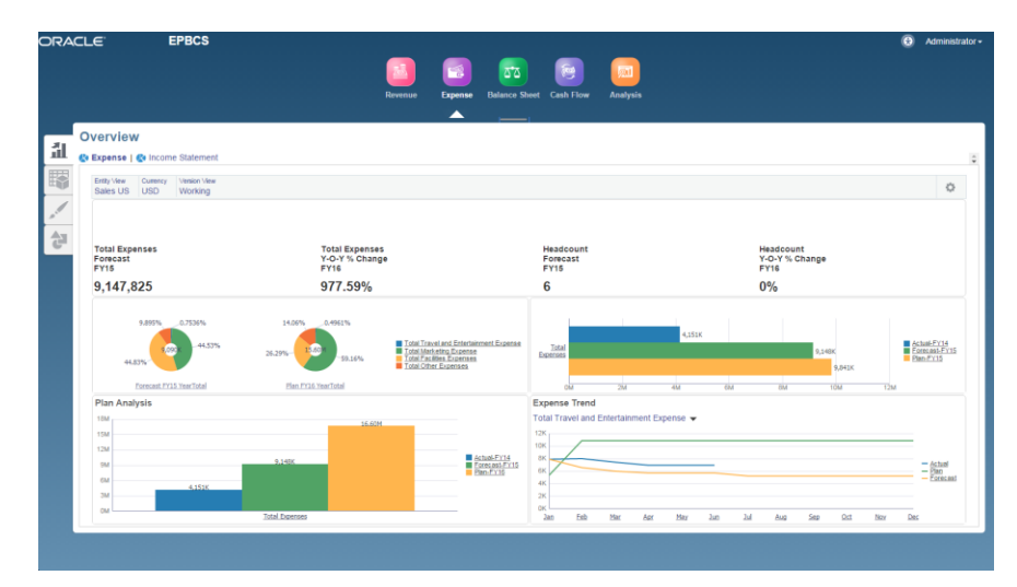
Figure 1. Configurable dashboards make it easy to quickly visualize your plans and forecasts in real-time.

Oracle Enterprise Planning and Budgeting Cloud Service is a match for the way you run your business. The solution strikes the ideal balance between providing built-in best practices while maintaining high configurability. It's the best of both worlds in a single solution. Some planning tools strive for simplicity. Others strive for flexibility. This solution accomplishes both by providing an innovative configuration framework that can be used out-of-the-box or further enriched for your unique requirements – all while maintaining the ease and upgradability of a cloud-based solution.