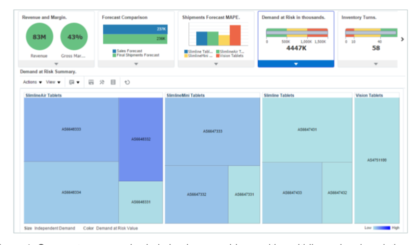
Figure 1. Segment your supply chain business problems with multidimensional analytics

Planning Central's next-generation graphical interface is designed for business users, so you can engage a broader range of stakeholders in the planning process. It offers mobile, desktop and spreadsheet access that enhances productivity.