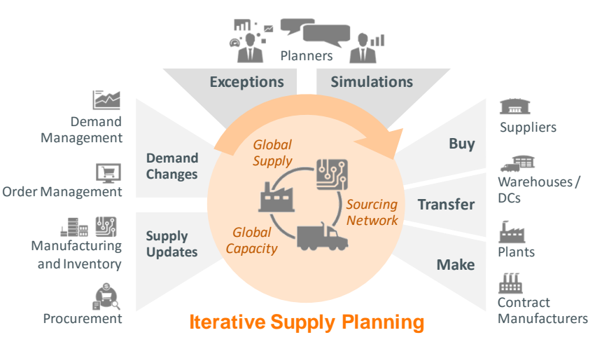
Figure 1. Quickly respond to changes in supply and demand across global networks

Today's supply chains are complex, with multiple tiers of internal and external nodes. Your supply plans must manage a global network of in-house production and distribution facilities, as well as contract manufacturers, drop ship suppliers and outside services providers.